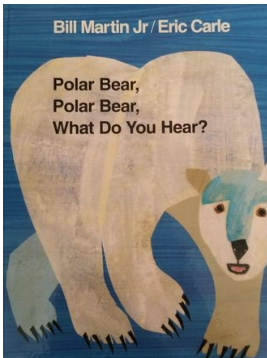
Polar Bear Polar Bear What Do You Hear by Bill Martin Jr. and Eric Carle